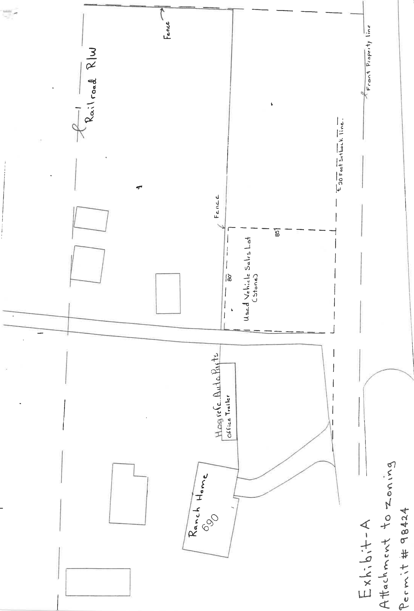
Exhibit-A Attachment to zoning Permit # 98424